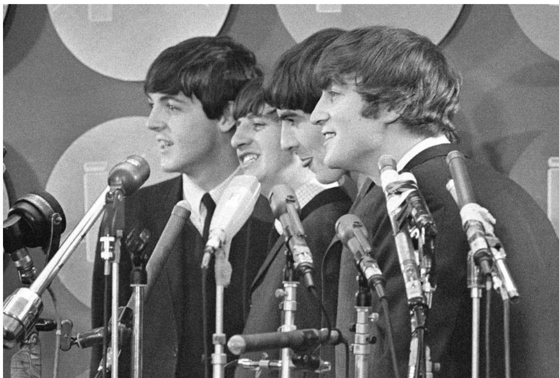
The Beatles address the media in the press room of Kennedy International Airport on their arrival, Feb. 7, 1964 in New York.

McCartney, Starr and the families of John Lennon and George Harrison have all signed off on the project through the band's Apple Corps. Ltd. Sony Music Publishing controls the rights